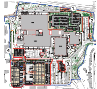
Key Plan 1:5000