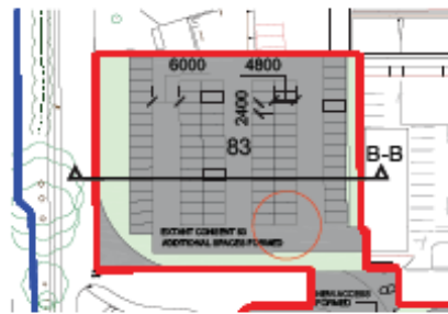
Car Park 4