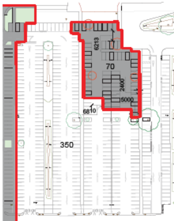
Car Park 3