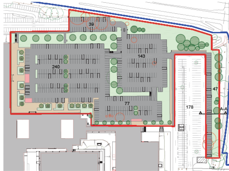
Car Park 1 & 2